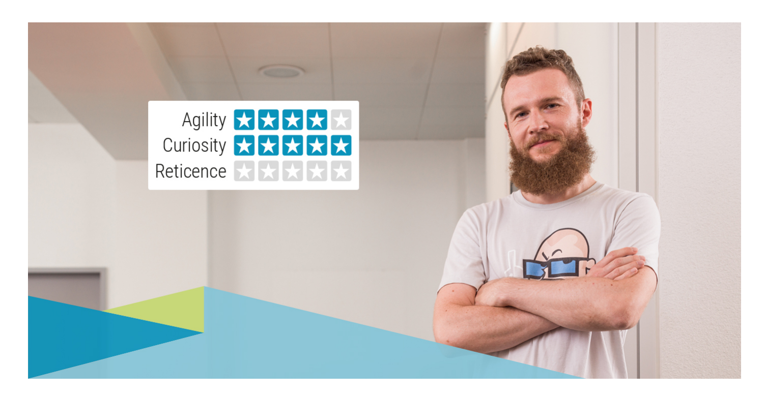
Machine Learning Engineer (f/m/x)